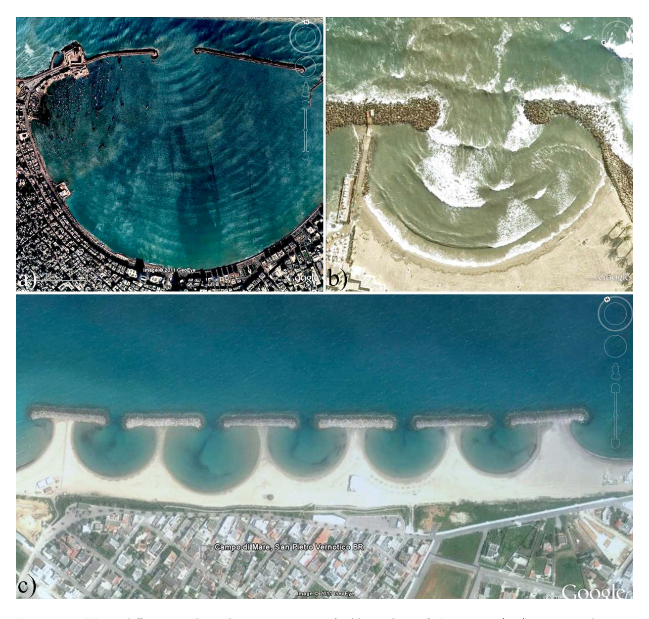
Figure 1: Wave diffraction through an opening: a) Alexandria of Egypt, 12/14/2010, coordinates: 31^{0}12'28.56"N , 29^{0}53'34.66"E ; b) Théoule-sur-Mer, France, 10/26/2006, coordinates: 43^{0}31'54.86"N , 6^{0}\,56'\,59.41 " E. c) Wave diffraction causes circular erosion of the beach: Campo di Mare, Italy, 4/18/2010, coordinates: 40^{\circ} 32' 27.33" N , 18^{\circ} 04' 09.17" E .

much less than a wavelength, we have to consider the mate formula for the velocity must be used for gravity friction effect of the sea floor. Then another approxi- waves: