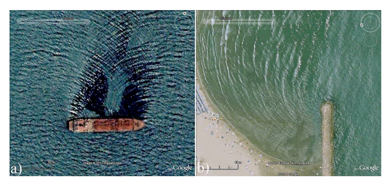
Figure 2: a) Diffraction produced by a boat: Cyprus, 7/7/2007, coordinates: 34^0 \, 56' \, 27.21"N , 33^0 \, 39' \, 17.36"E . b) Diffraction of waves against the end of a protection barrier: La Grande-Motte, France, 8/21/2006, coordinates: 43^0 \, 33' \, 18.71"N , 4^0 \, 05' \, 20.01"E .