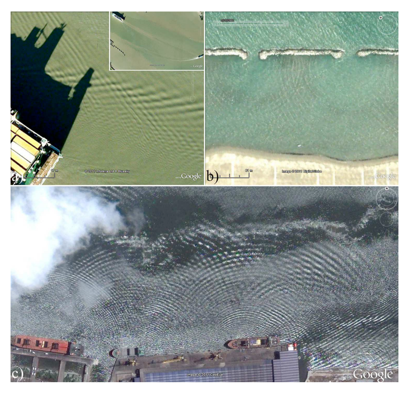
Figure 5: Interference between wave fronts producted by the wakes of two boats: a) River Thames, London, England, 11/06/2006, coordinates: 51^0\,27'\,40.79"\,N , 0^0\,16'\,05.69"\,E . Interference between circular waves coming from two openings: b) Rimini, Italy, 5/28/2002, coordinates: 44^0\,05'\,15.02"\,N , 12^0\,32'\,26.07"\,E . Interference from secondary sources: c) Chao Phraya River, Bangkok, Thailand, 8/20/2010, coordinates: 13^0\,36'\,40.11"\,N , 100^0\,34'\,46.60"\,W .