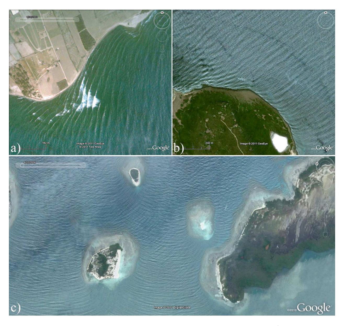
Figure 3: Examples of wave refraction, the wave fronts bend approaching the beach a) Villaricos, Spain, 4/26/2002, coordinates: 37^0\,14'\,04.59 " N,\ 1^0\,47'\,04.79 " E. b) Sardegna, Italy, 8/18/2010, coordinates: 39^0\,46'\,12.64 " N,\ 8^0\,27'\,28.82 " E. c) Chichiriviche, Venezuela, 4/27/2006, coordinates: 10^0\,55'\,29.88 " N,\ 68^0\,15'\,26.93 " W.

imate plane waves into circular waves. The diffracted It produces the circular erosions of the beach showed waves distribute their energy on circular wave fronts. It produces the circular erosions of the beach showed waves distribute their energy on circular wave fronts.